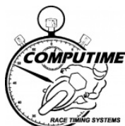
Clerk of Course - Peter Hall